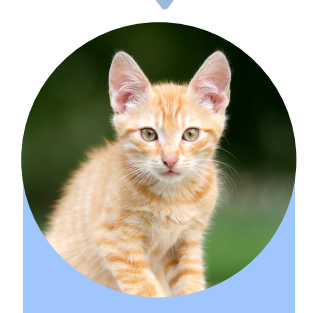
8+ WEEKS OLD Very active and playful; 2 pounds or more