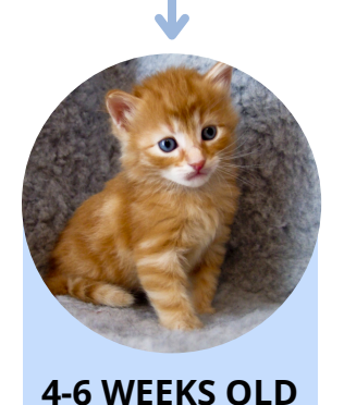
Very mobile and often talkative; can eat food