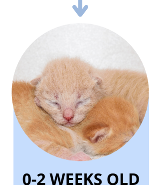
Eyes closed or barely open